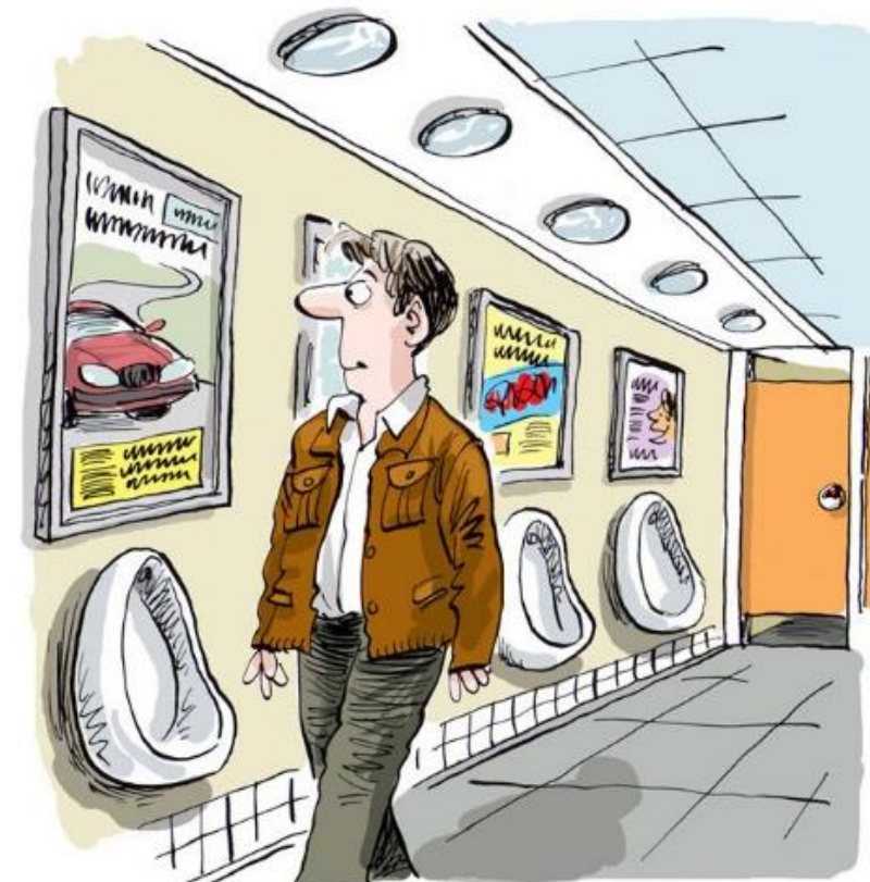
Above the gents urinals ...un-missable!