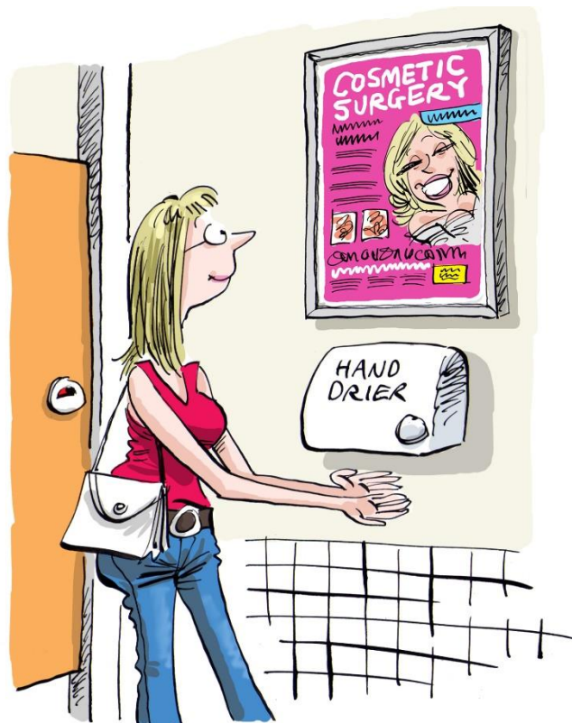
In both ladies and gents toilets above the hand dryers ...high-vis!