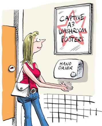
Seeing our posters!