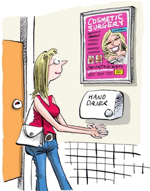
In both ladies and gents toilets above the hand dryers ...high-vis!