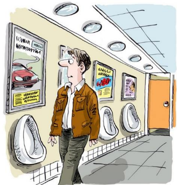
Above the gents urinals ...unmissable!