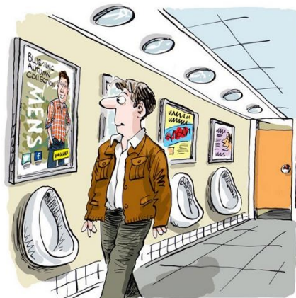
Unmissable above the urinals!