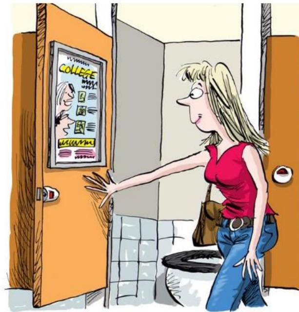
On the back of ladies cubicle doors ...very captive!