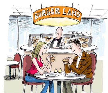
Grabbing Something to eat!